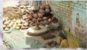
Rich Living Traditions