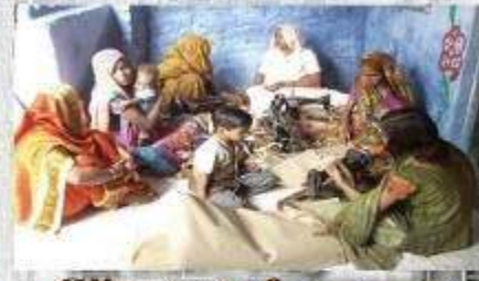
Glimpses of Rural life